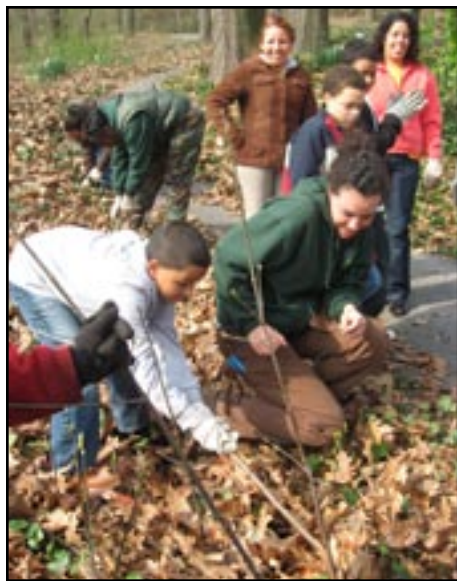
Students from the Muskota New School, being trained in invasive plant removal and woodland restoration on the east side of the park by Manhattan team members of the GreenApple Corps, pull Norway maple seedlings out of the woodlands.

Since March, student groups from our neighborhood, our city, and from out of state have gotten their hands dirty weeding,