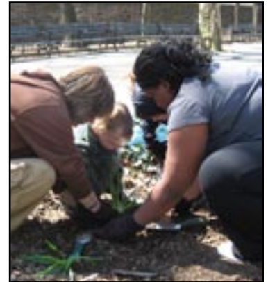
Preschool children from the YM-YWHA of Washington Heights plant pansies at the Anne Loftus Playground.